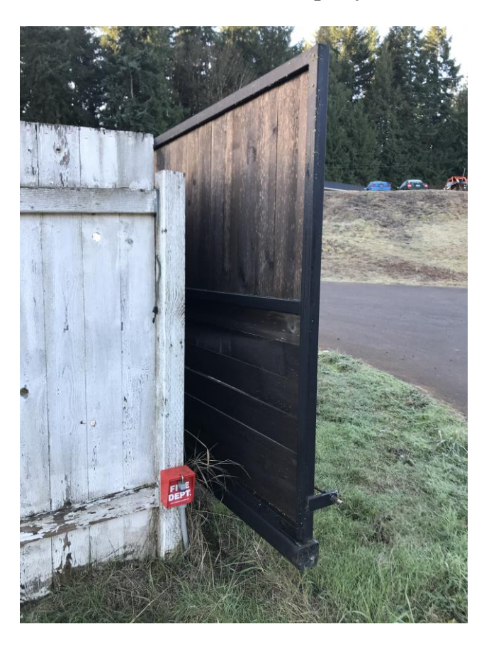
Electric Gate at Property

The submitted community letter states that the subject property has a large electric gate at the access point to Berry Hill Drive, which further causes traffic backup and turnaround issues for delivery vehicles on the road. This gate was observed and was open during Staff's site visit on 12/21/2022 at approximately 9:00 AM. The applicant states that the gate is open during business hours and has a reserve power supply in case of an outage. As can be seen in the image below, the Fire Department also has access to open this gate in case of emergency.